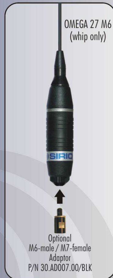
OMEGA 27 M6 (whip only)