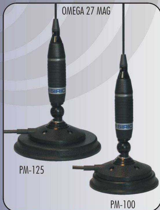
OMEGA 27 MAG